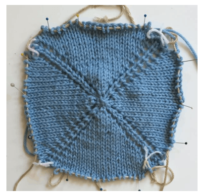
5 sts of each corner on holders

Lightly steam the squares before weaving together using the Kitchener stitch. Do no weave the corner stitches that are on stitch holders.