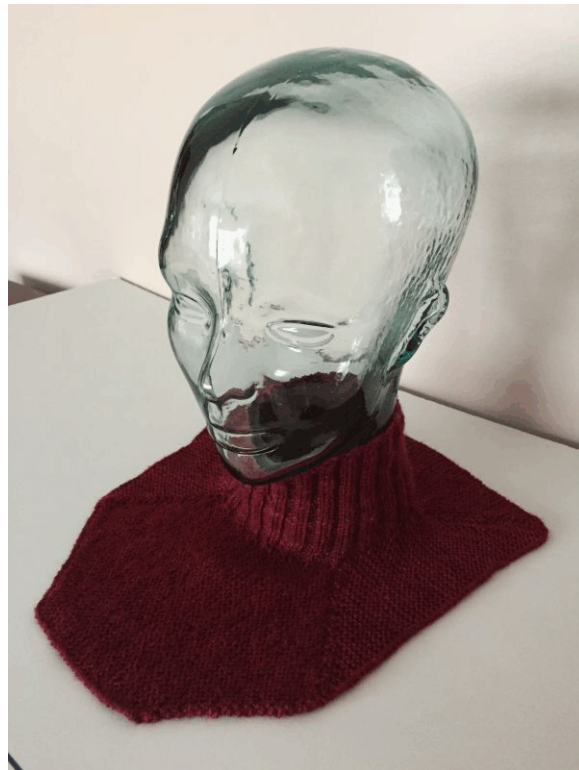
Knitted with Adorn Luxe

1 yard of similar weight contrast color yarn yarn needle