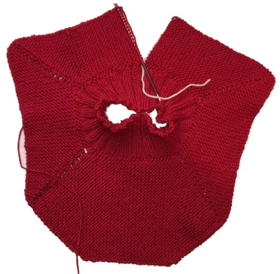
Sirdar Snuggly Baby Bamboo

Repeat these 4 rows until desired length, ending after working Row 2.