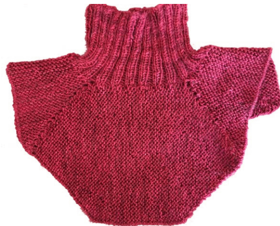
Miss Babs Yummy 3-ply

Continue in this manner, ending with Short Row 15: k17, TURN, knit to end of row.