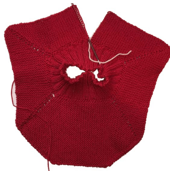
Sirdar Snuggly Baby Bamboo

Repeat these 4 rows until desired length, ending after working Row 2.