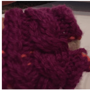
Completed after weaving.