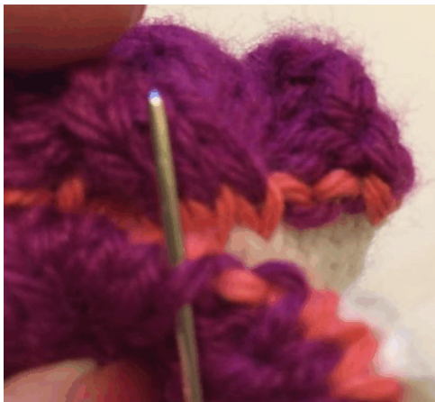
Insert needle in right side of first stitch of the cable on the lower piece.