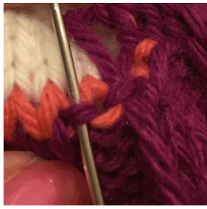
Continue following the path on the lower piece.