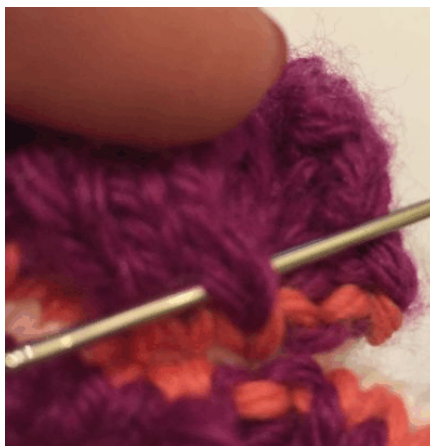
Insert needle through the first V of the cable on the upper piece.