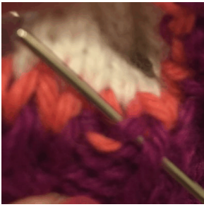
On the lower piece, go through the left leg of the last cable stitch and up the purl bump.